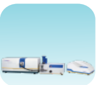
Laser Particle Size Analyzer